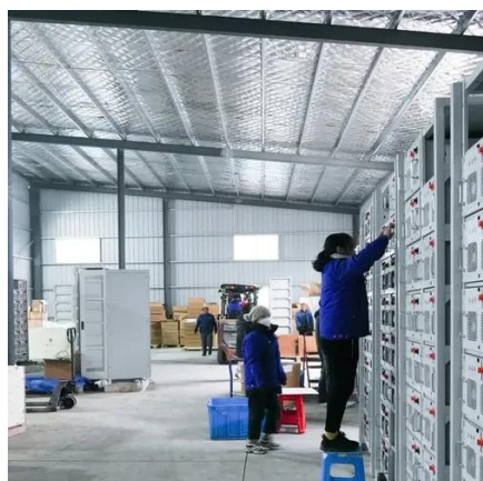
Outdoor ODM BESS Energy Storage System 50-100kWh Cabinet

Prefabricated cabin compact substation high voltage 11kV switchgear electric transformer substation Product description Box type substation is a compact complete set of distribution ...