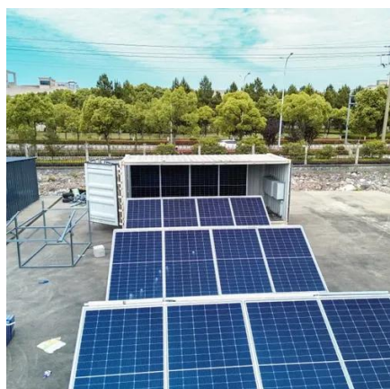
ESS-GRID FlexiO Series 500kW 1MWh Battery Microgrid Outdoor ...

Huijue Network products are exported to Europe, North America, Southeast Asia and other countries and regions, contact us now! - Huijue Group.